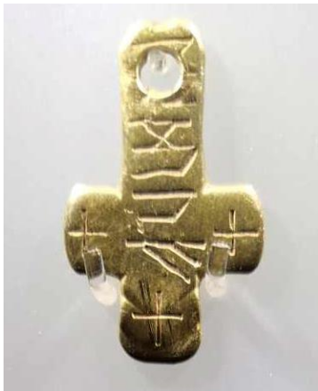
The Ord Cross between the 7th & 10th century