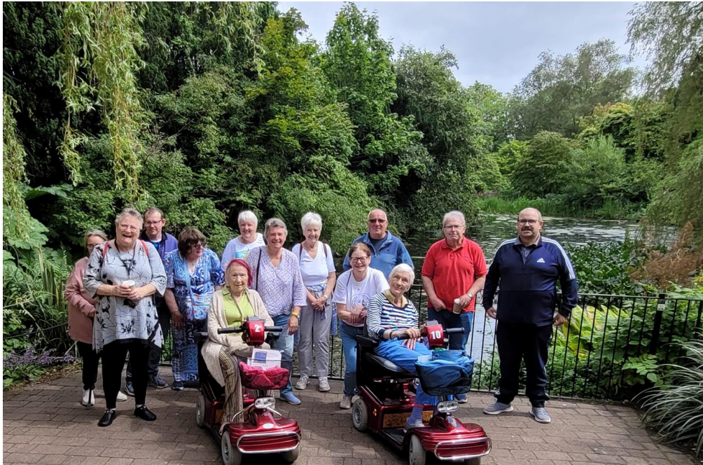
A great pic of everybody and what a lovely setting and a beautiful day! How did you manage that!!