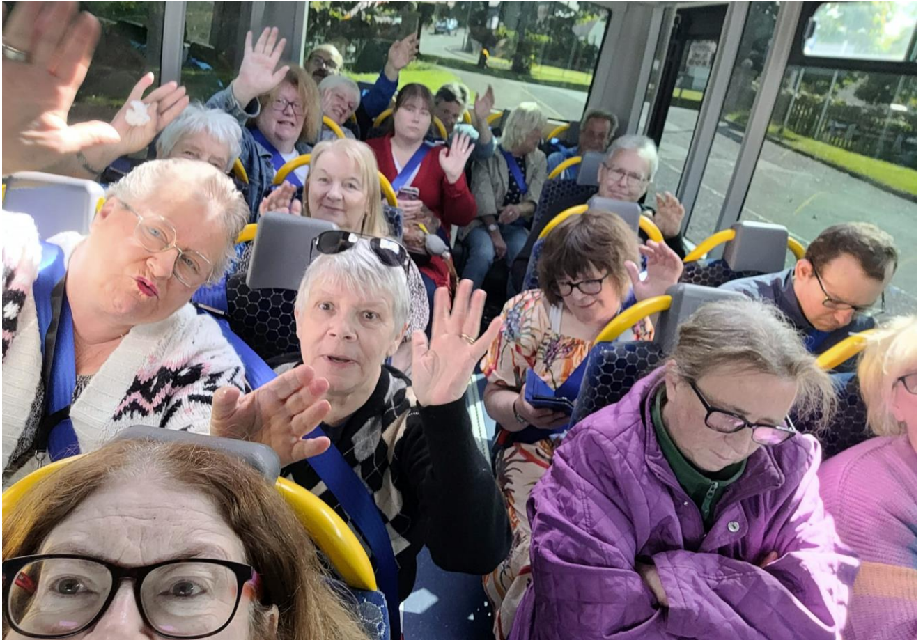
Limoncello Restaurant for lunch

And we are Off! On our Magical Mystery Tour!! (Did not know that the bus was going to break down – but happily on the way home!!)