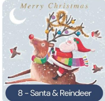
8 - Santa & Reindeer