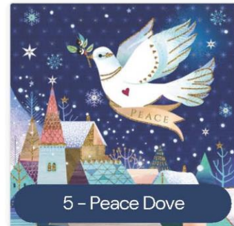
5 - Peace Dove