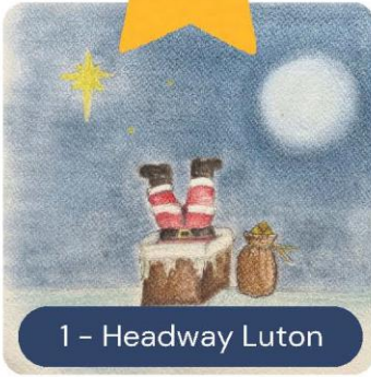
1 - Headway Luton