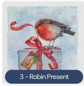
3 - Robin Present