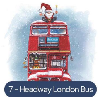
7 - Headway London Bus