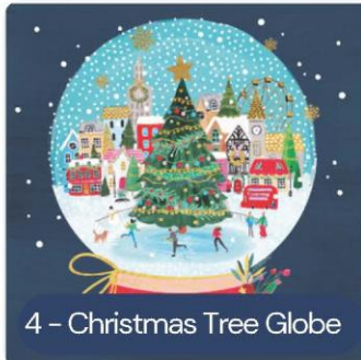
4 - Christmas Tree Globe